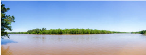
Neches River Tidal at Collier's Ferry Park

Assessment Units: 0601_01, 0601_02, 0601_03, 0601_04